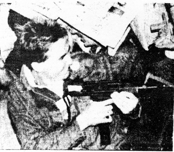
Who IS this guy?

The audience may be growing younger, but I'm sure not. And neither is the size of this cast. We are getting female responses to our call for new cast members, and we'd still like more since choice is a beautiful thing, but we are not getting male responses. What kind of men are you? Some of you had better stand up or we're going to come out there plucking! RR