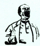
the BALD SOPRANO

What more do I have to say. For those of you still unsure, take some "friendly" advice. You don't make it to CENTENIAL WEEKEND, you're DEAD. That's right - D E A D. Finito lifo. Can you dig that? You'll be killed!