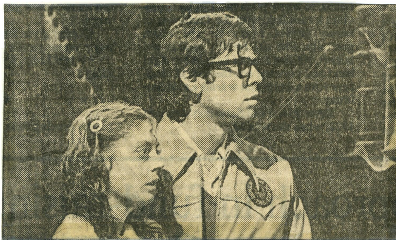
MOVIE NERDS: Brad Majors (Barry Bostwick) and Janet Weiss (Susan Sarandon) in Rocky Horror Picture Show .