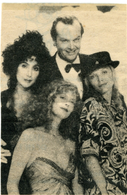
The one that got away: 'The Witches of Eastwick'

QUESTIONS OR COMMENTS? WRITE : R. I. ROCKY, 100 LYMAN AVE, NORTH PROVIDENCE, RI 02911