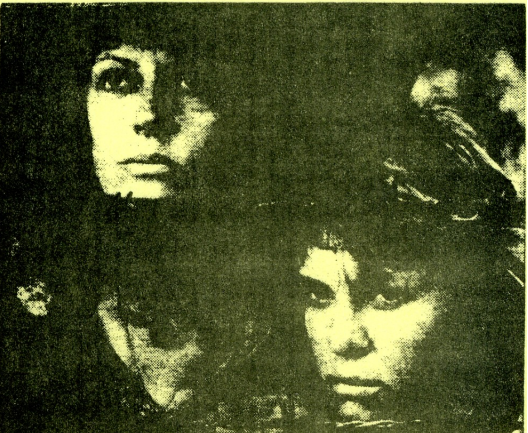
PRISONERS OF WAR: Susan Sarandon, left, and Kristy McNichol brave abuse in a Japanese camp during World War II.