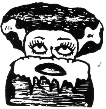
MAGENTA-CREAM FILLED BUNDT CAKE